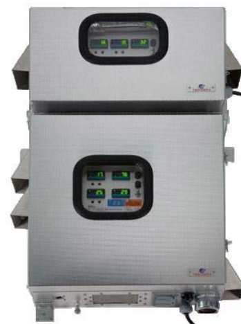
Shown installed with Model 1130

One of the greatest problems with conventional particulate mercury measurement methods is that reactive gaseous mercury will be trapped on the filter medium along with the particulate bound mercury. This can result in large measurement artefacts. The Tekran speciation system solves this problem by removing the reactive gaseous component using a denuder before sampling the particulate mercury.